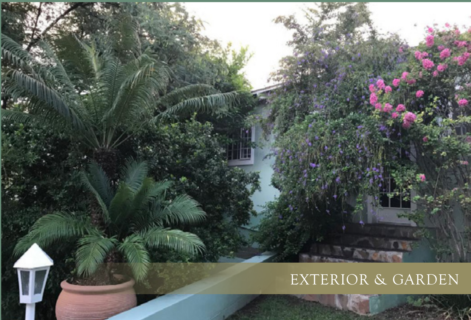
EXTERIOR & GARDEN