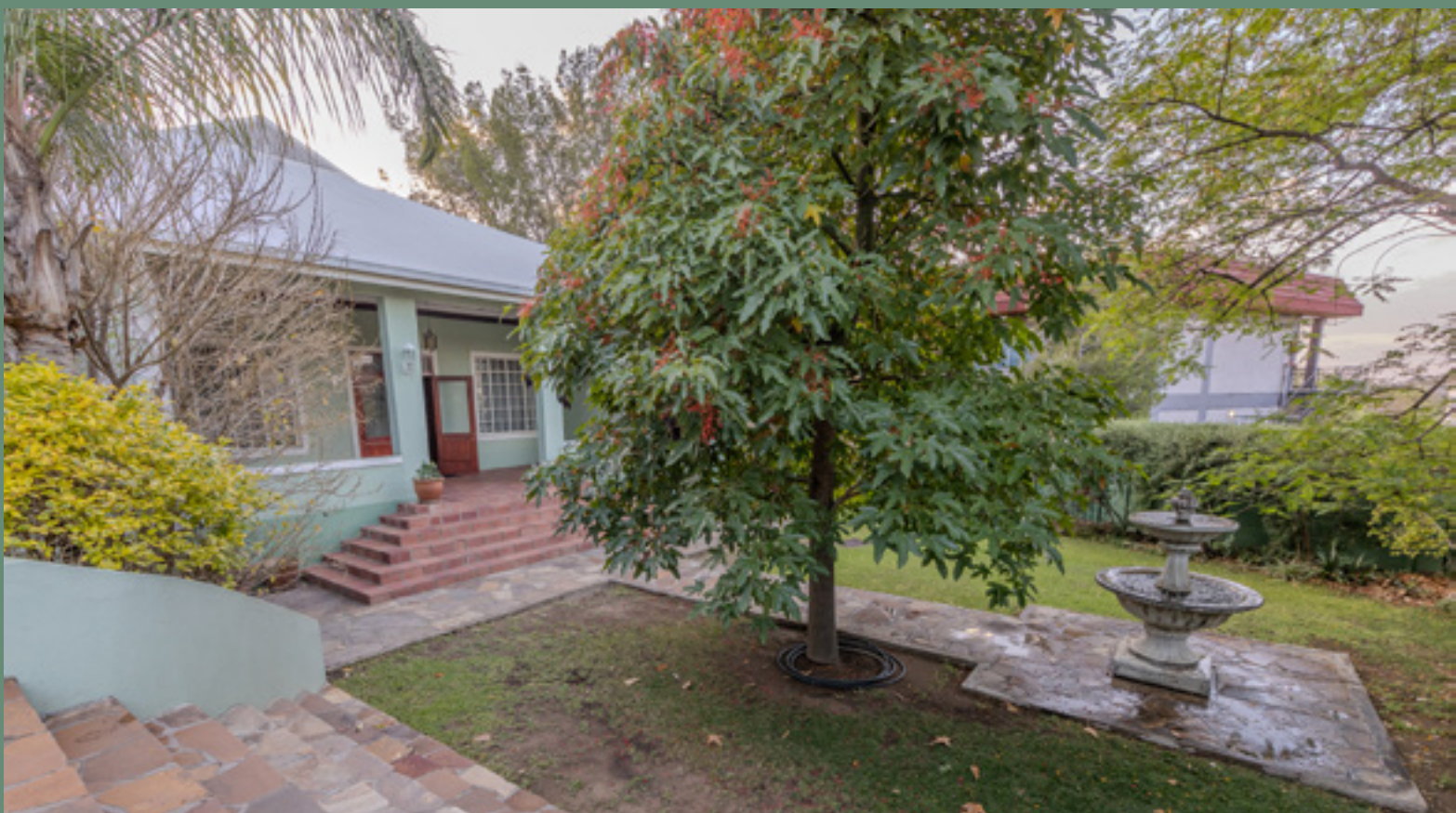
EXTERIOR & GARDEN