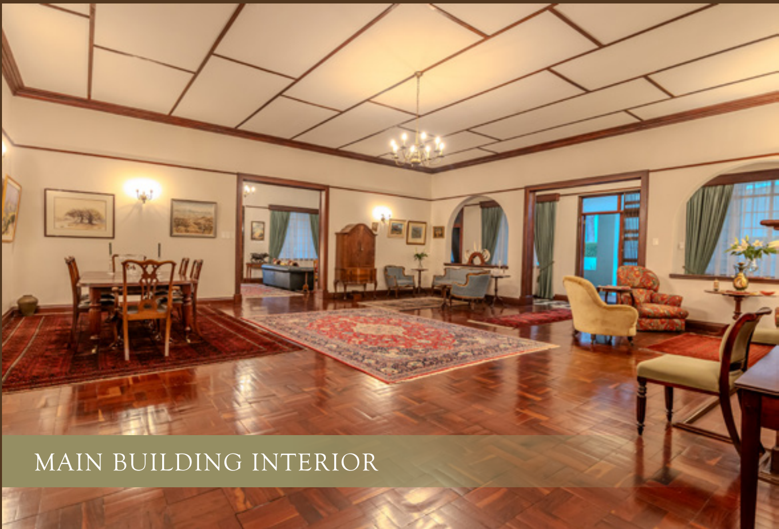
MAIN BUILDING INTERIOR