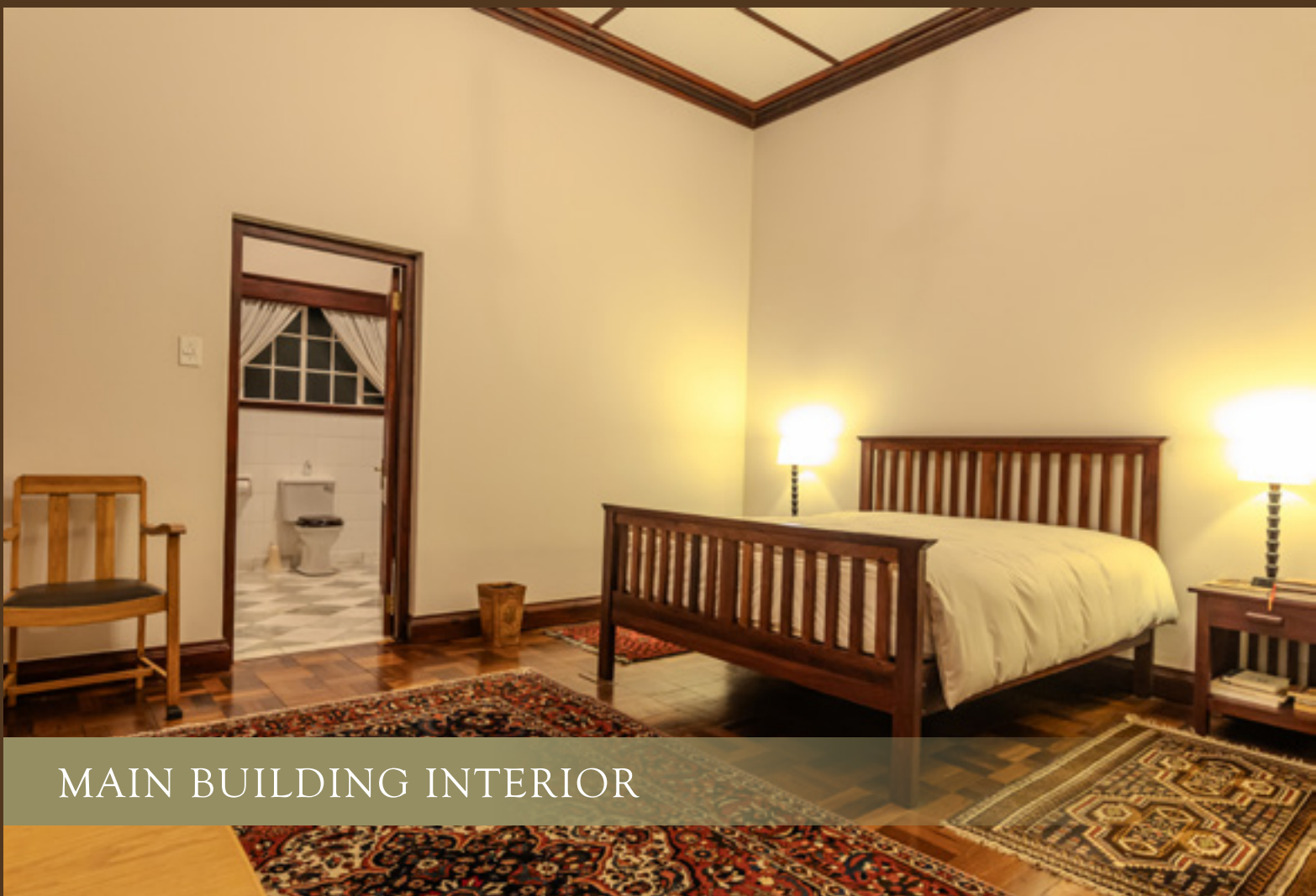
MAIN BUILDING INTERIOR