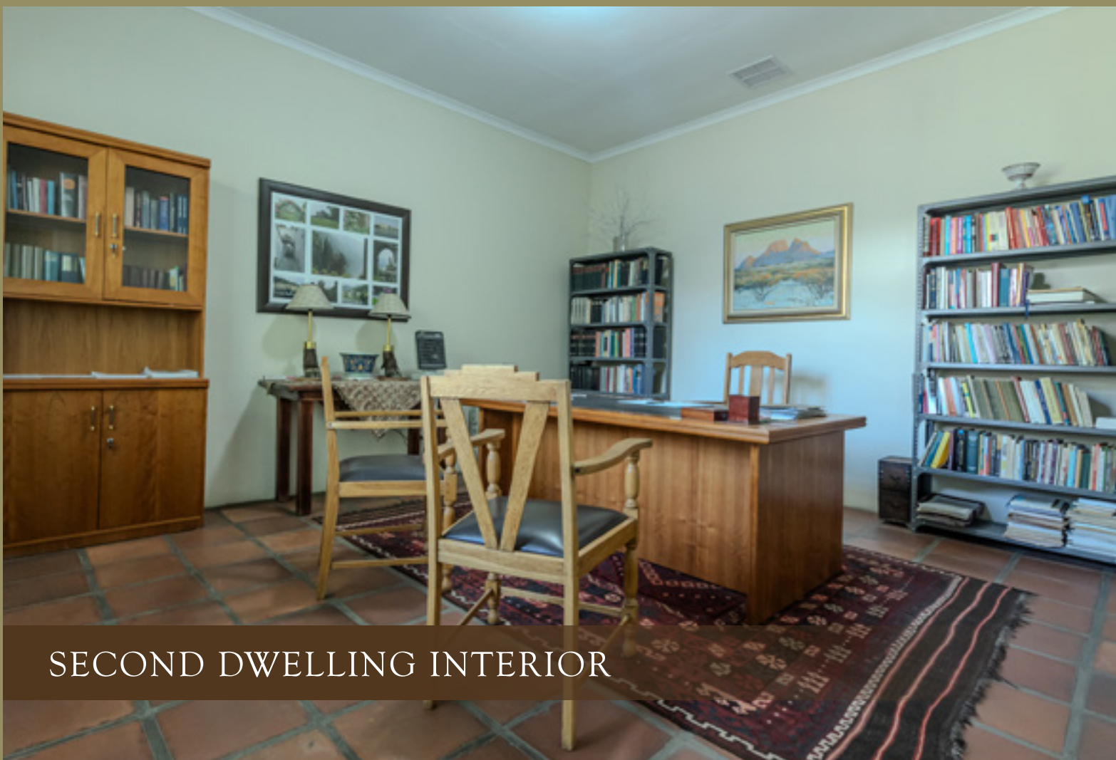
SECOND DWELLING INTERIOR